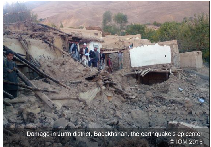
Damage in Jurm district, Badakhshan, the earthquake's epicenter

Initial reports indicate 196 families affected, with four killed and 40 injured in seven districts. A joint assessment team consisting of ANDMA, ACTED, Mission East, WFP, PAT and ARCS initiated assessment on 27 October. So far, 237 families were found to be affected, with assessments in the affected districts ongoing. IOM deployed field staff to Takhar to assist ANDMA and joint teams with assessment and coordination.