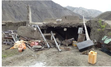
Assessment of affected families in Zadran District, Paktia Province on 16 May, 2017