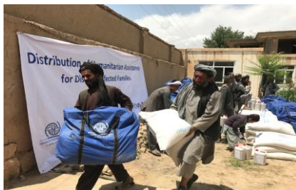
Distribution to 15 flood affected families in Khuram Sarbagh District, Samangan Province on 16 May, 2017

In a separate incident, On 16 May, 20 families were reportedly affected by flood in Argo district. IOM along with ANDMA initiated an assessment on 17 May, the distribution will take place once the assessment is concluded.