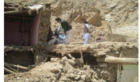
Assessment of flood affected families in Nahrin District, Baghlan Province on 11 May, 2017