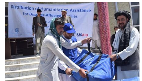
Distribution of NFIs to flood affected families of Zadran district, Paktia province, 22 May, 2017.