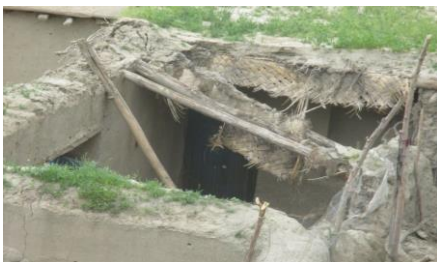
Assessment of flood affected families in Argo District, Badakhshan Province,

38 families were reportedly affected by flood in Zadran district on 15 May. IOM along with ANDMA, RRD, DAIL and ARCs conducted an assessment and verified 38 families in need of relief items. On 22 May, IOM distributed family, blanket and emergency shelter modules while ANDMA distributed cash assistance to address the food needs of the affected families.