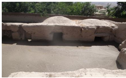
Assessment of flood affected families in Obe District, Herat Province, 17 May, 2017