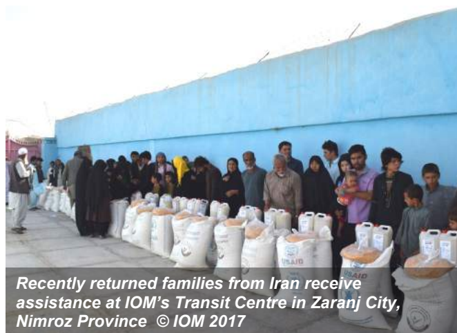
Recently returned families from Iran receive assistance at IOM's Transit Centre in Zaranj City, Nimroz Province

IOM provided post-arrival humanitarian assistance to 416 (7%) undocumented Afghans deported from Iran at its Transit Centers in Herat and Nimroz, including 35 special cases, 10 medical cases, 5 chronically ill cases and 44 unaccompanied migrant children.