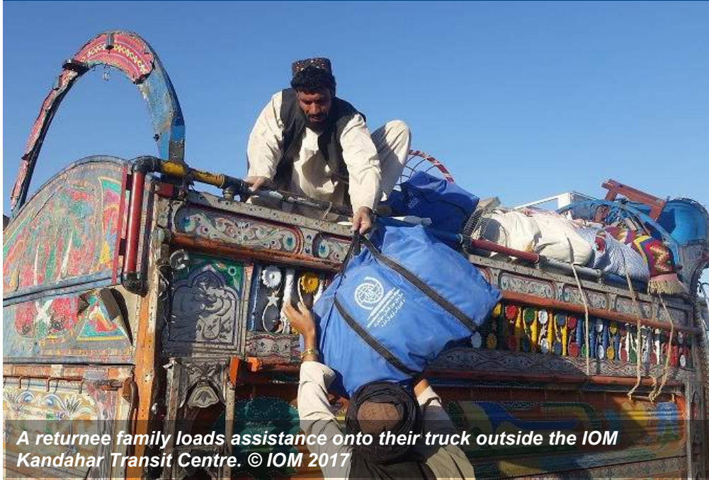
A returnee family loads assistance onto their truck outside the IOM Kandahar Transit Centre.