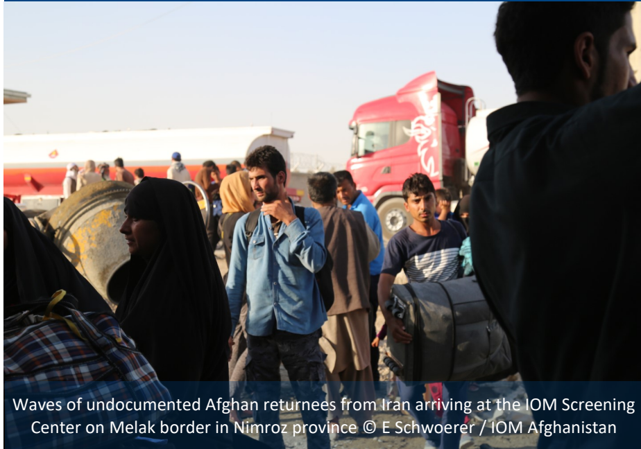
Waves of undocumented Afghan returnees from Iran arriving at the IOM Screening Center on Melak border in Nimroz province