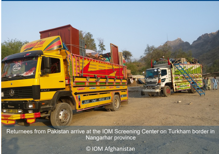
Returnees from Pakistan arrive at the IOM Screening Center on Turkham border in Nangarhar province