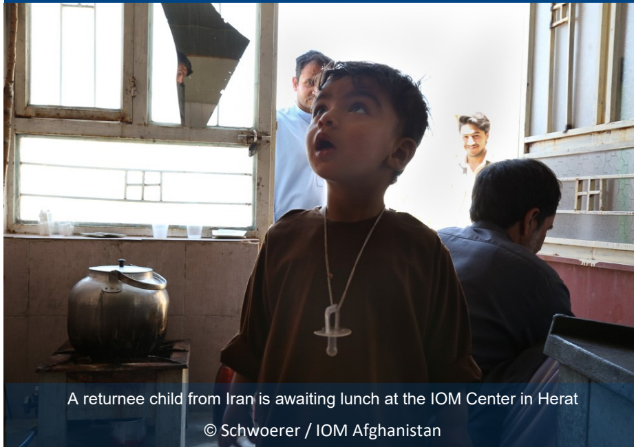
A returnee child from Iran is awaiting lunch at the IOM Center in Herat