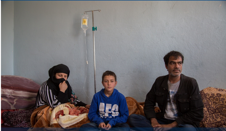
A deportee family from Iran at the IOM Center in Herat. The mother received medical support due to the stress of the journey.