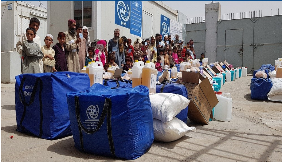
Returnee families from Pakistan at the IOM Transit Center near Spin Boldak border