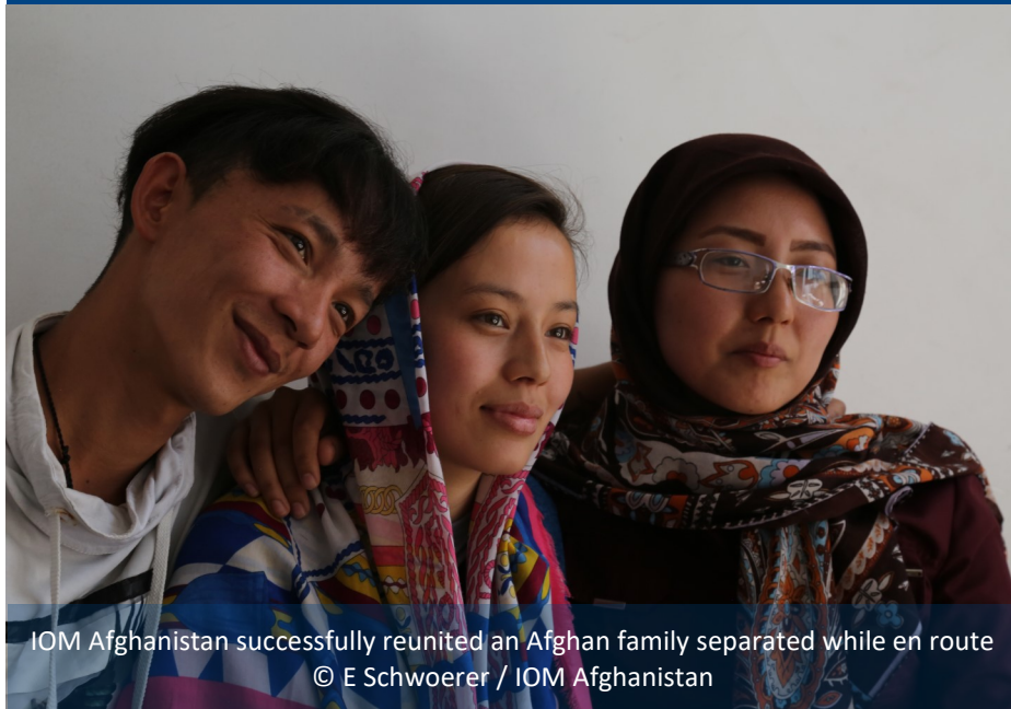
IOM Afghanistan successfully reunited an Afghan family separated while en route