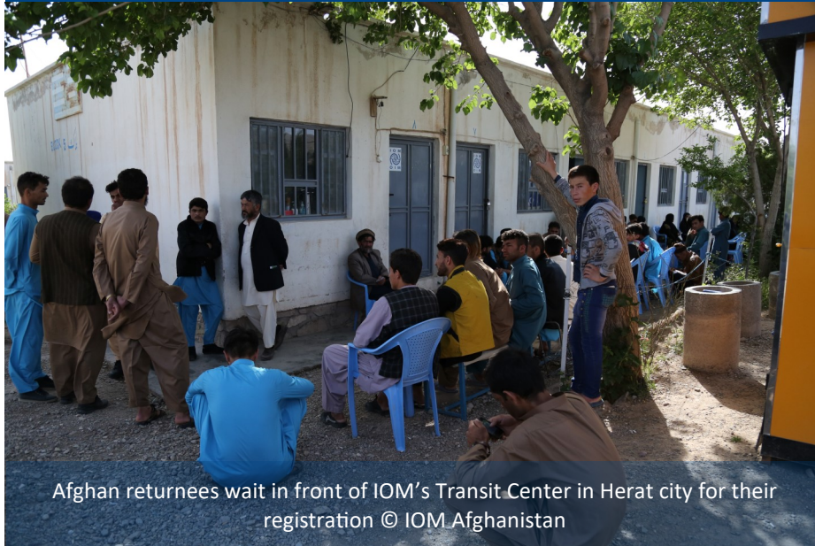
Afghan returnees wait in front of IOM's Transit Center in Herat city for their registration