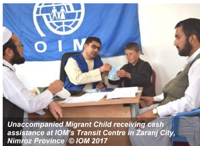
Unaccompanied Migrant Child receiving cash assistance at IOM's Transit Centre in Zaranj City, Nimroz Province

IOM provided post-arrival humanitarian assistance to 252 (4%) undocumented Afghans deported from Iran at its Transit Centers in Herat and Nimroz, including 28 special cases and 10 medical cases.