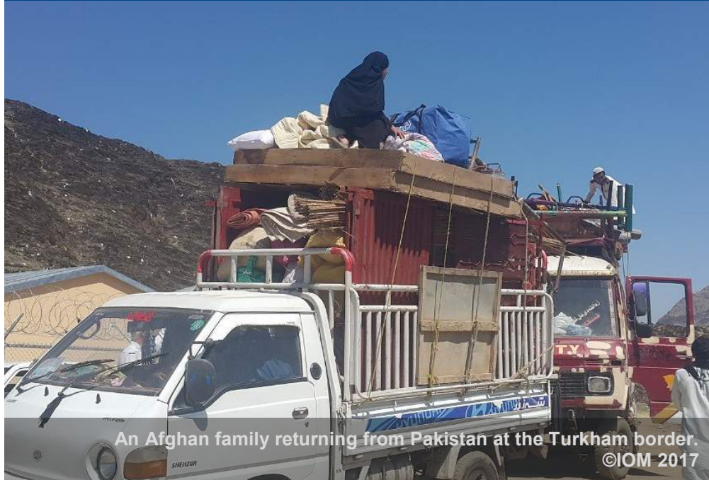
An Afghan family returning from Pakistan at the Turkham border.