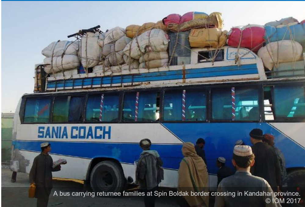
A bus carrying returnee families at Spin Boldak border crossing in Kandahar province.