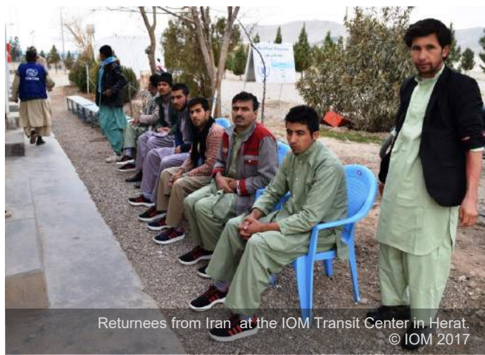
Returnees from Iran at the IOM Transit Center in Herat.

IOM provided post-arrival humanitarian assistance to 199 (2.5%) undocumented Afghans arriving from Iran at its Transit Centers in Herat and Nimroz provinces, including 53 unaccompanied migrant children and 25 individuals with special medical needs. A gap in assistance remains, as DoRR estimates that approximately 10% of undocumented Afghans returning from Iran are in need of humanitarian assistance.