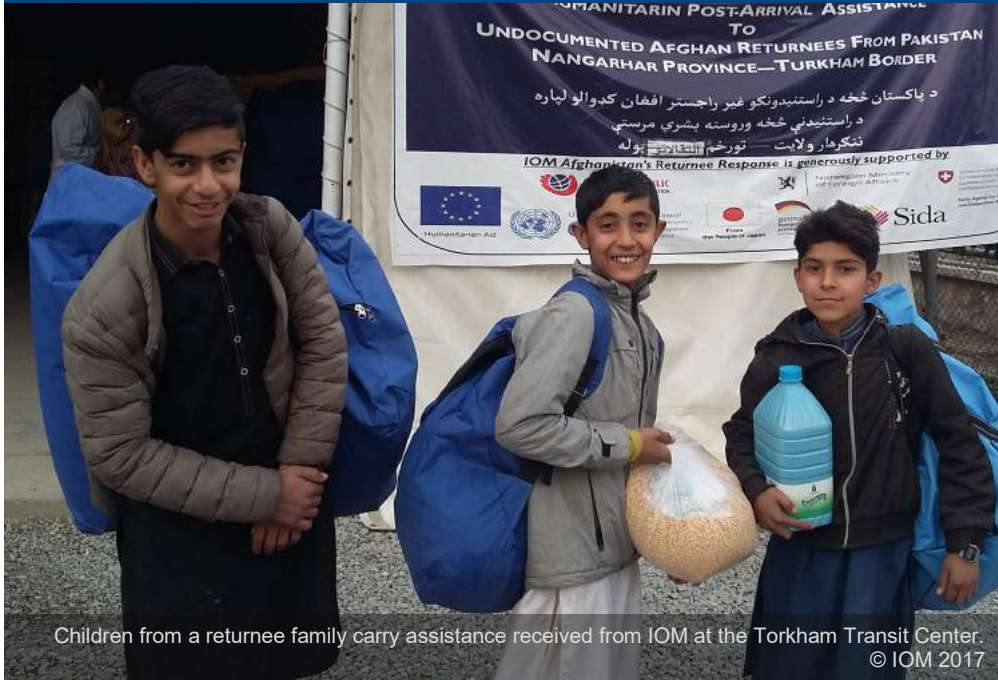
Children from a returnee family carry assistance received from IOM at the Torkham Transit Center.