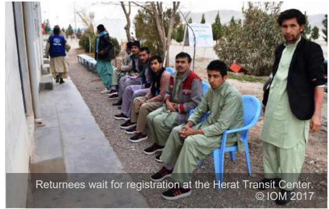
Returnees wait for registration at the Herat Transit Center.

IOM provided post-arrival humanitarian assistance to 305 (4%) undocumented Afghans arriving from Iran at its Transit Centers in Herat and Nimroz, including 69 unaccompanied migrant children (UMC) and 30 persons in need of special medical assistance.