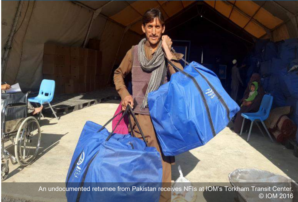
An undocumented returnee from Pakistan receives NFIs at IOM's Torkham Transit Center.