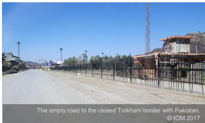
The empty road to the closed Torkham border with Pakistan.

IOM provided post-arrival humanitarian assistance to 285 (11%) undocumented Afghans arriving from Iran at its Transit Centers in Herat and Nimroz. The bodies of nine Afghans killed in a car crash in Yazd, Iran were repatriated to their home province of Faryab.