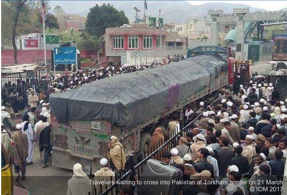
Travelers waiting to cross into Pakistan at Torkham border on 21 March