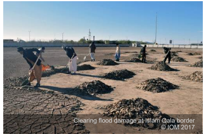
Clearing flood damage at Islam Qala border

A total of 9,315 undocumented Afghans spontaneously returned or were deported from Iran from 2-8 April, all of them through Milak border in Nimroz province. Islam Qala border remains closed for undocumented returns due to recent flooding. Out of the total spontaneous returnees, 264 (8%) were in family groups and 3,244 (92%) were individuals. Similarly, out of the total deportees, 519 (9%) were in family groups whereas 5,288 (91%) were individuals. This brings the total number of undocumented returnees from Iran since 1 January 2017 to 74,992 . IOM provided post-arrival humanitarian assistance to 404 (2%) undocumented Afghans deported from Iran at its Transit Center in Nimroz, including 38 unaccompanied migrant children, 25 medical cases, 24 special cases, 7 single parents and 6 unaccompanied elderly.