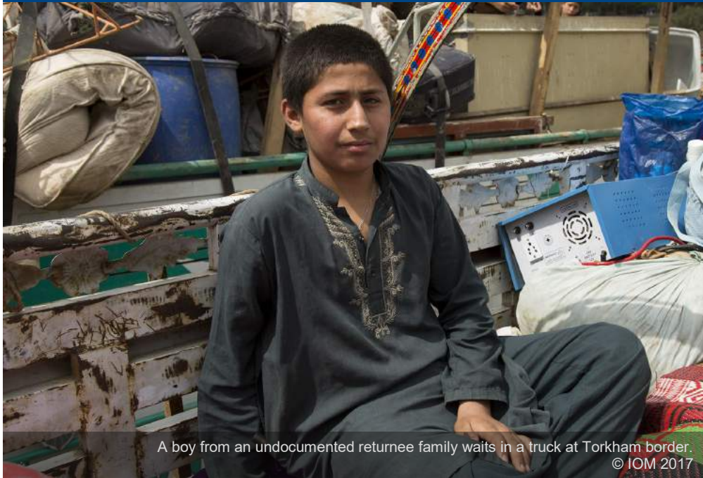
A boy from an undocumented returnee family waits in a truck at Torkham border.