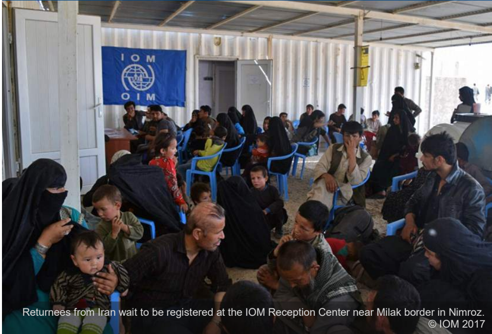
Returnees from Iran wait to be registered at the IOM Reception Center near Milak border in Nimroz.