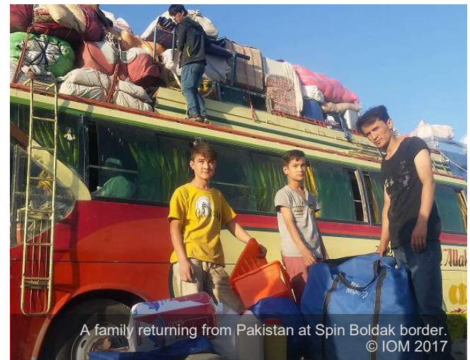
A family returning from Pakistan at Spin Boldak border.

Cash grants for onward transportation totaling $90,410 were provided to 506 families (2,884 individuals) at Torkham and Kandahar Transit Centers.