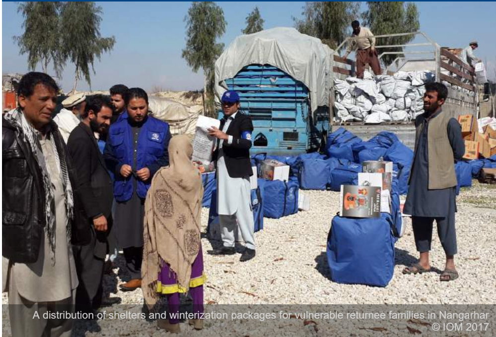
A distribution of shelters and winterization packages for vulnerable returnee families in Nangarhar