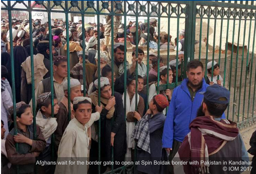
Afghans wait for the border gate to open at Spin Boldak border with Pakistan in Kandahar