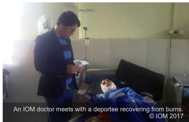
An IOM doctor meets with a deportee recovering from burns.

IOM provided post-arrival humanitarian assistance to 271 (5%) undocumented Afghans arriving from Iran at its Transit Centers in Herat and Nimroz, including 80 unaccompanied migrant children and 17 people with special medical needs.