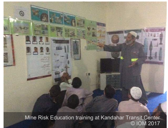
Mine Risk Education training at Kandahar Transit Center

IOM provided post-arrival assistance to 94% of undocumented Afghan returnees from Pakistan (5,438 individuals), including 855 single parents and 5 special cases. The assistance provided includes meals, accommodation, Non-Food Items (NFIs), onward transportation and referral services, as well as support from partners (see Annex 1).