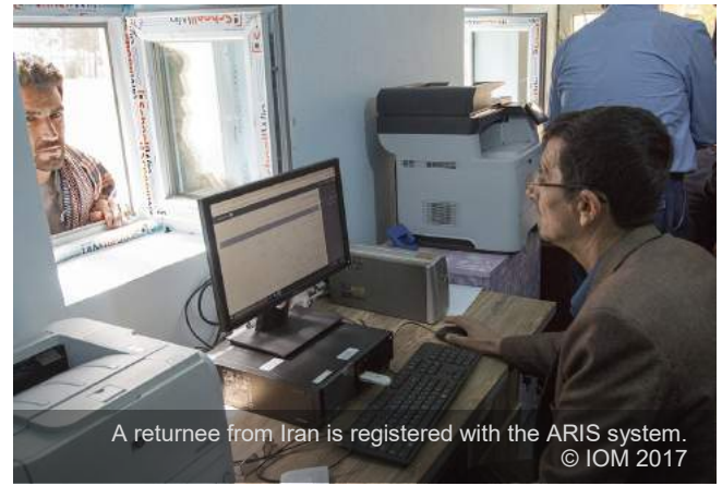
A returnee from Iran is registered with the ARIS system.

IOM provided post-arrival humanitarian assistance to 415 (4%) undocumented Afghans deported from Iran at its Transit Centers in Herat and Nimroz, including 47 unaccompanied migrant children.