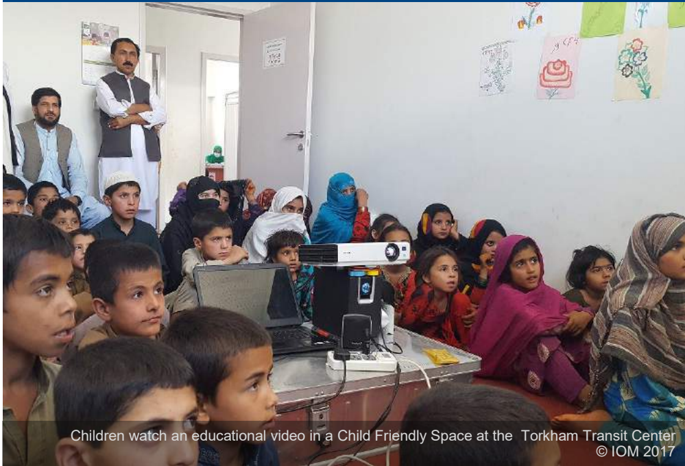
Children watch an educational video in a Child Friendly Space at the Torkham Transit Center