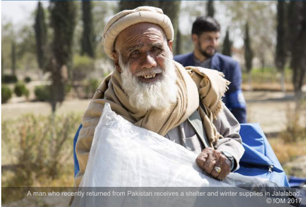
A man who recently returned from Pakistan receives a shelter and winter supplies in Jalalabad.