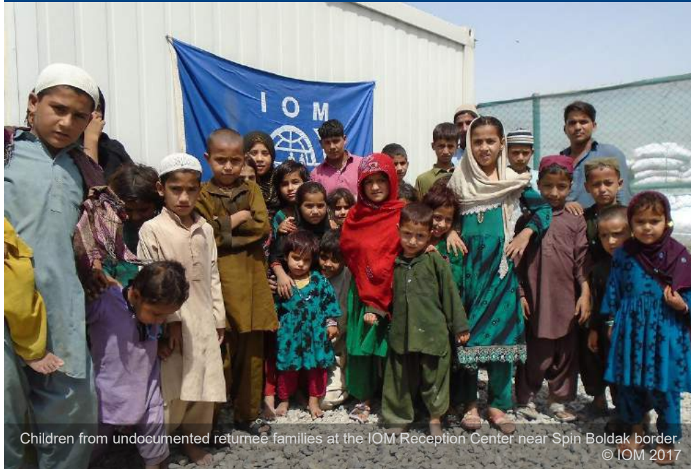
Children from undocumented returnee families at the IOM Reception Center near Spin Boldak border.