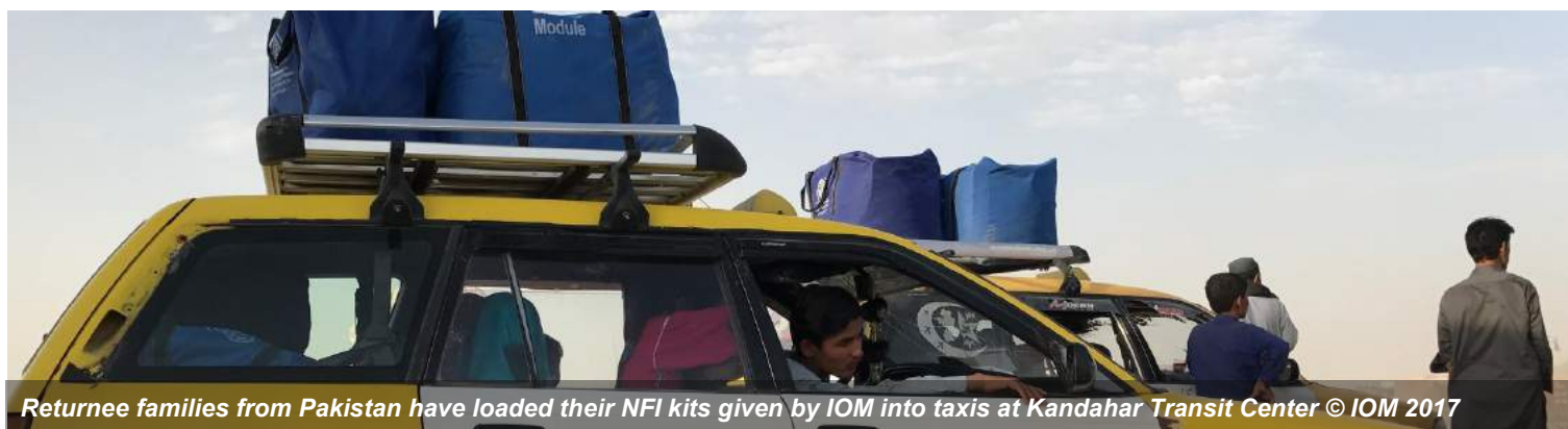
Returnee families from Pakistan have loaded their NFI kits given by IOM into taxis at Kandahar Transit Center