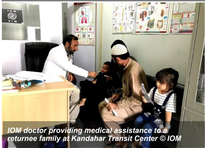
IOM doctor providing medical assistance to a returnee family at Kandahar Transit Center