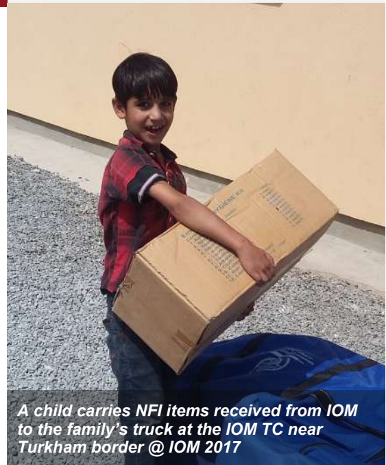
A child carries NFI items received from IOM to the family's truck at the IOM TC near Turkham border

Of the total returnees, 1,228 were spontaneous returnees and 79 were deported. With a 2% decrease, this number is very similar to the previous week (1,337). The total number of undocumented Afghan returnees from Pakistan since 01 January 2017 is now 86,801. IOM provided post-arrival assistance to 96% of undocumented Afghan returnees from Pakistan (1,249 individuals), including 1,057 individuals in poor families and 162 individuals in single parent families. The assistance provided includes meals, accommodation, basic medical screening, Non-Food Items (NFIs), onward transportation cash grants and referral services, as well as support from partners.