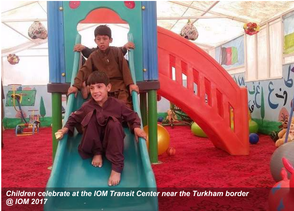
Children celebrate at the IOM Transit Center near the Turkham border