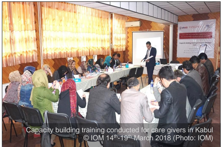
Capacity building training conducted for care givers in Kabul 14 th -19 th March 2018