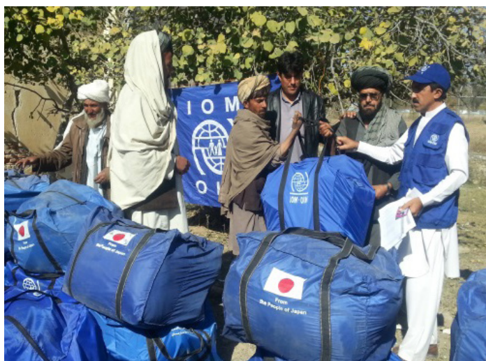
Displaced Afghans in Khost receive relief supplies at an IOM distribution on 16 November