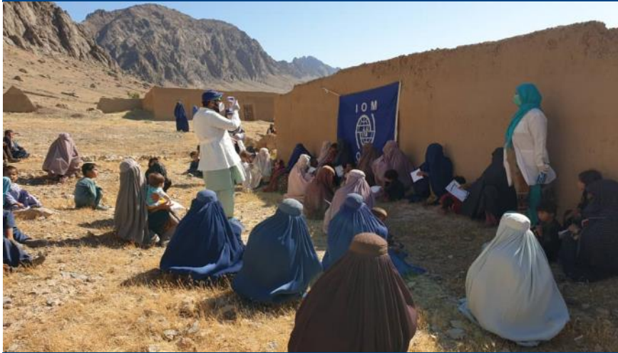
IOM is providing health education sessions on COVID-19 to local communities. This session for women and children was carried out by one of IOM's Mobile Health Teams on the outskirts of Kandahar city.