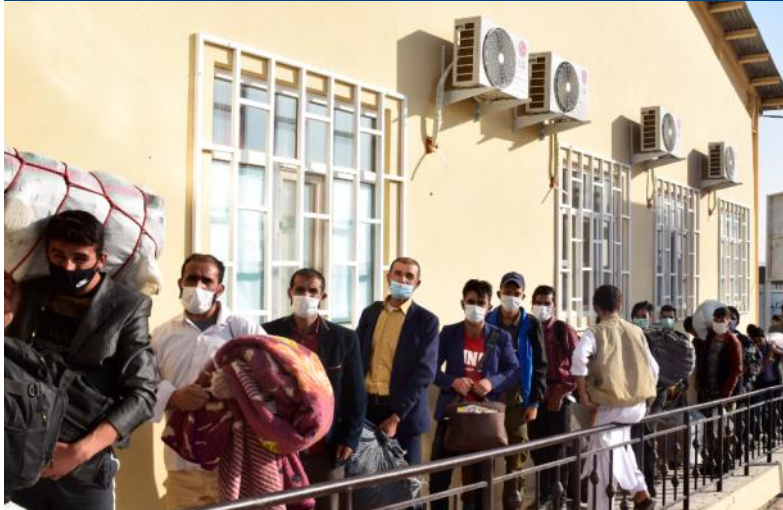
The Islam Qala reception center on 10 November 2020. This year returns from Iran through Herat province of undocumented Afghan migrants have remained exceptionally high with over 458,000 migrants returning via the Islam Qala border crossing.