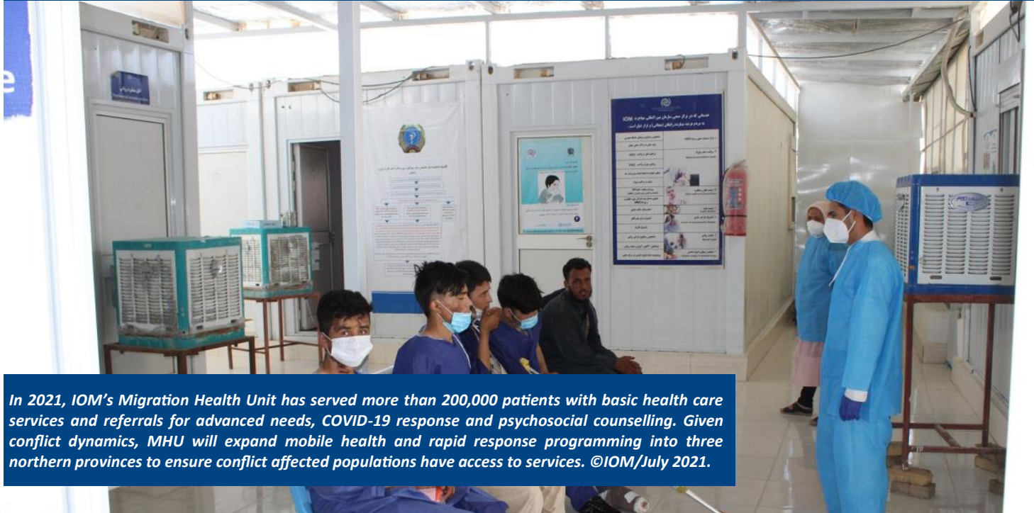
In 2021, IOM's Migration Health Unit has served more than 200,000 patients with basic health care services and referrals for advanced needs, COVID-19 response and psychosocial counselling. Given conflict dynamics, MHU will expand mobile health and rapid response programming into three northern provinces to ensure conflict affected populations have access to services.