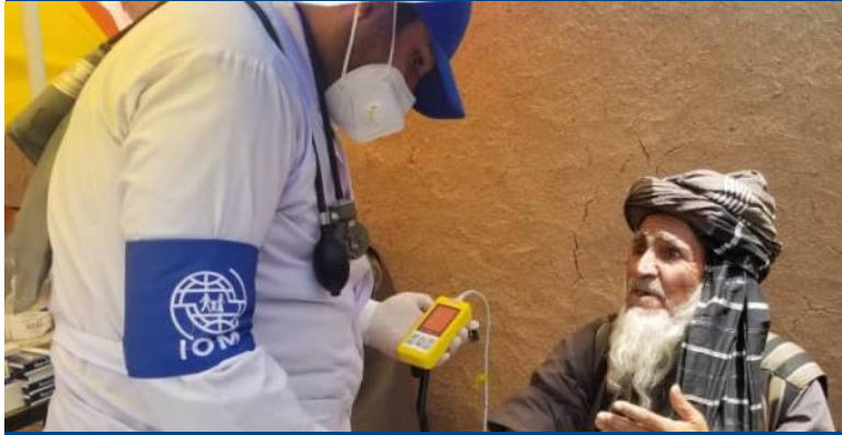
Under a private sector contribution from LifeBox, IOM's medical staff in Kandahar province measure a patient's oxygen saturation levels using a pulse oximeter without using needles or taking a blood sample.