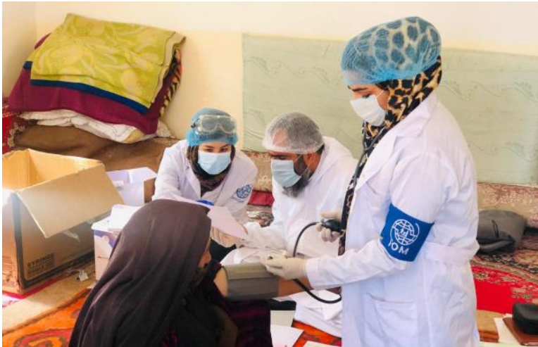
One of IOM's 5 Rapid Response Teams carry out basic health consultations and COVID-19 screening at the IDP settlement of Sharak e-Razi in Herat province. IOM's RRTs collect upwards of 90% of all samples in Herat. @IOM, February 2021 .