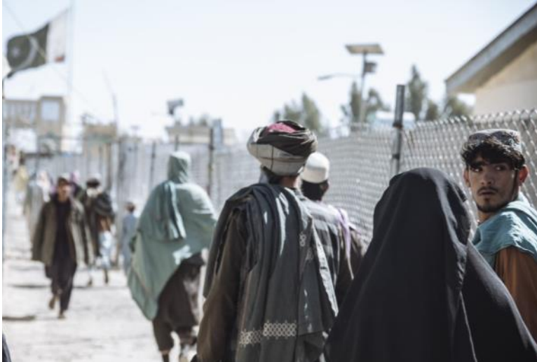
Returns over the past week exceeded 30,000 persons for the first time in 2021 ahead of upcoming Nawroz religious holidays. Muse Mohammed/IOM, March 2021.