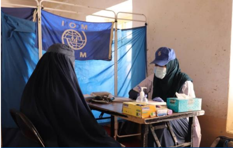
IOM's mobile health teams continue to provide basic health services inclusive of child and maternal care within displacement areas across Kandahar province. Unfortunately, without new funding receipts, half of IOM's field level health teams will close in June 2021.