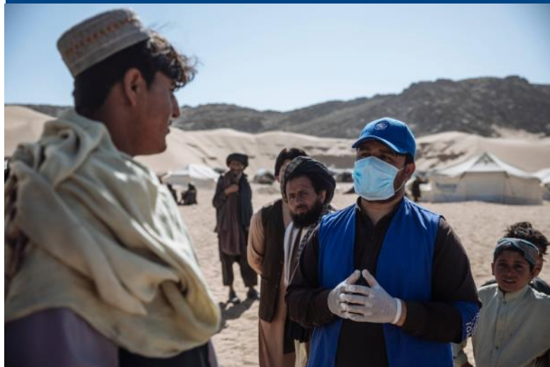
In Kandahar province's Dand district, one of IOM's migration health teams provides basic primary healthcare services including awareness on COVID-19 to over 700 conflict displaced families. @Muse Mohammed/IOM, February 2021 .