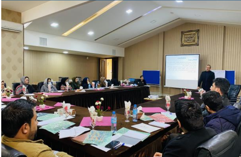
IOM completed multiple workshops on Camp Coordination and Camp Management throughout 2020 for IOM and partner organization staff in Nimroz, Herat, Kandahar and Jalalabad including modules on principled humanitarian access and the Joint Operating Principles.