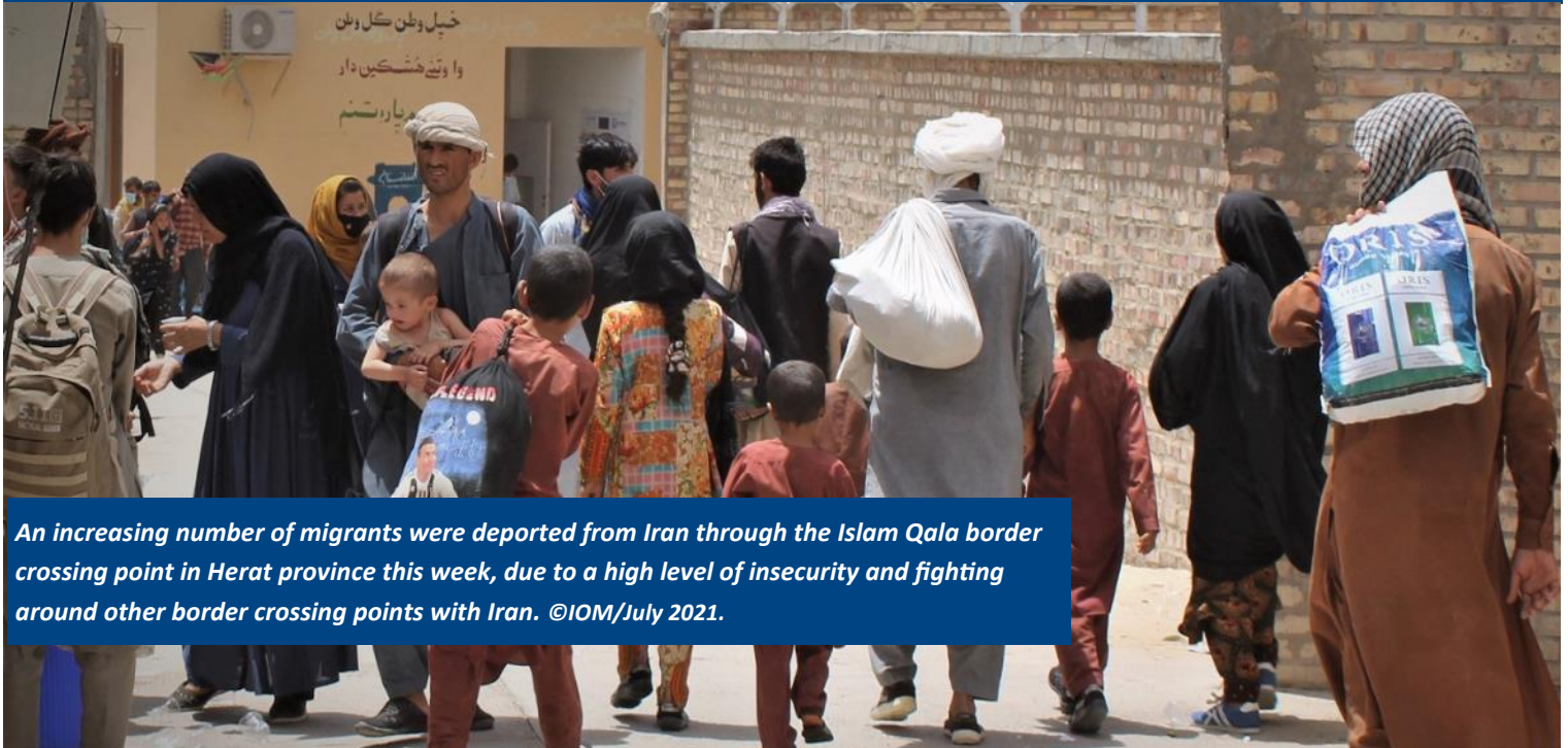
An increasing number of migrants were deported from Iran through the Islam Qala border crossing point in Herat province this week, due to a high level of insecurity and fighting around other border crossing points with Iran. ©IOM/July 2021.