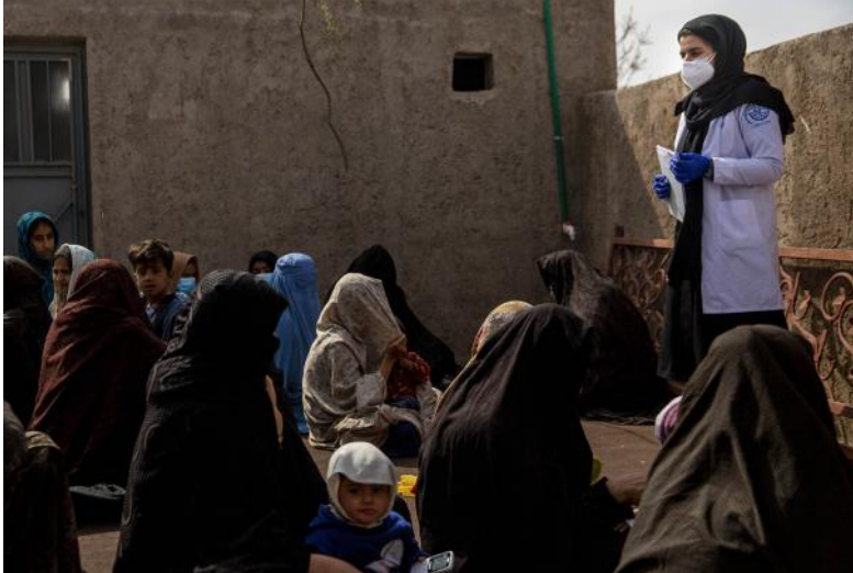
IOM's Rapid Response Teams continue to carry out health education, basic health consultations and provision of essential medicines to more than 70 underserved communities in provinces of high return. ©Angela Wells/IOM, February 2021.