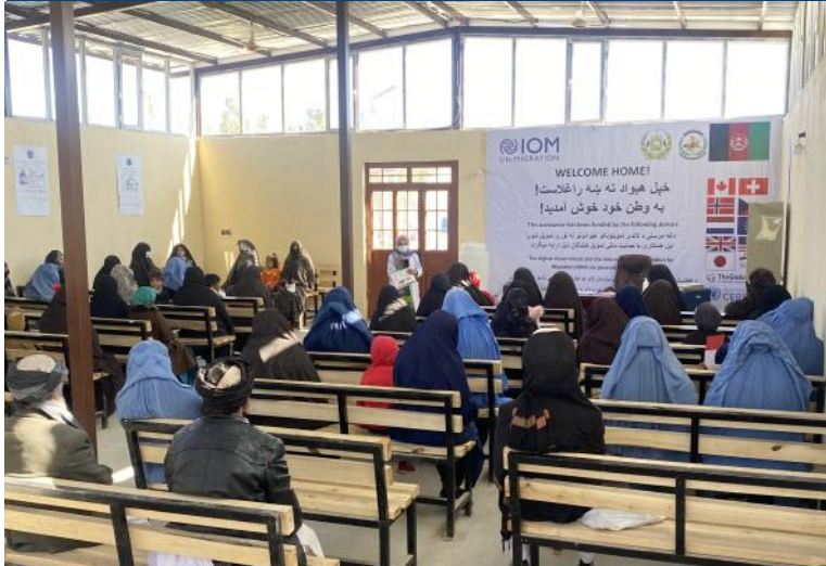
IOM's Migration Health Team at the Garzagah Transit Center in Herat city continues to provide basic health education and awareness on Covid-19 prevention to returnees and host community members.