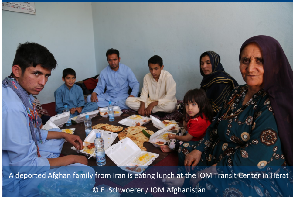
A deported Afghan family from Iran is eating lunch at the IOM Transit Center in Herat