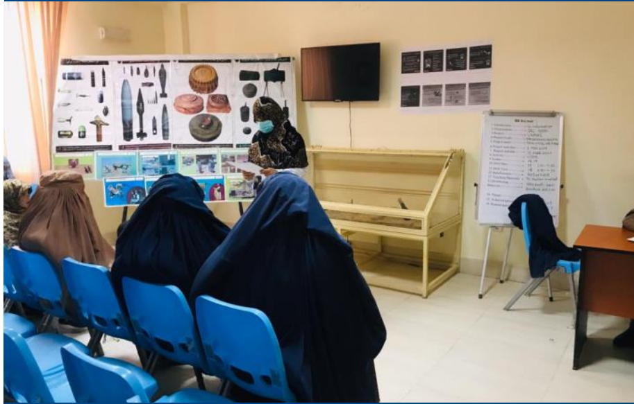
Returning documented Afghan females receive Mine Risk Education awareness sessions from DRC-DDG at IOM's Spin Boldak Reception Center in Kandahar province.