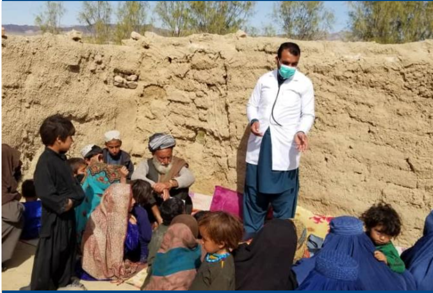
IOM has recently begun basic health service provision in Kandahar's Zhari IDP settlement to its underserved population. IOM's doctor provides health education sessions to community residents.