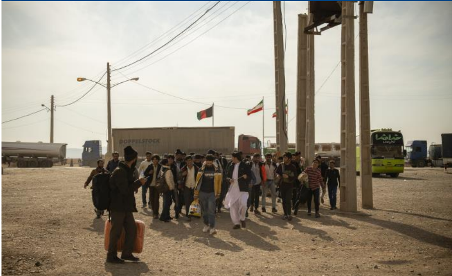
Deportees from Iran after disembarkation in Islam Qala outside of the NRC constructed Reception Center where they will be registered by the Afghan government and referred to IOM for assistance before being transported to Herat city.