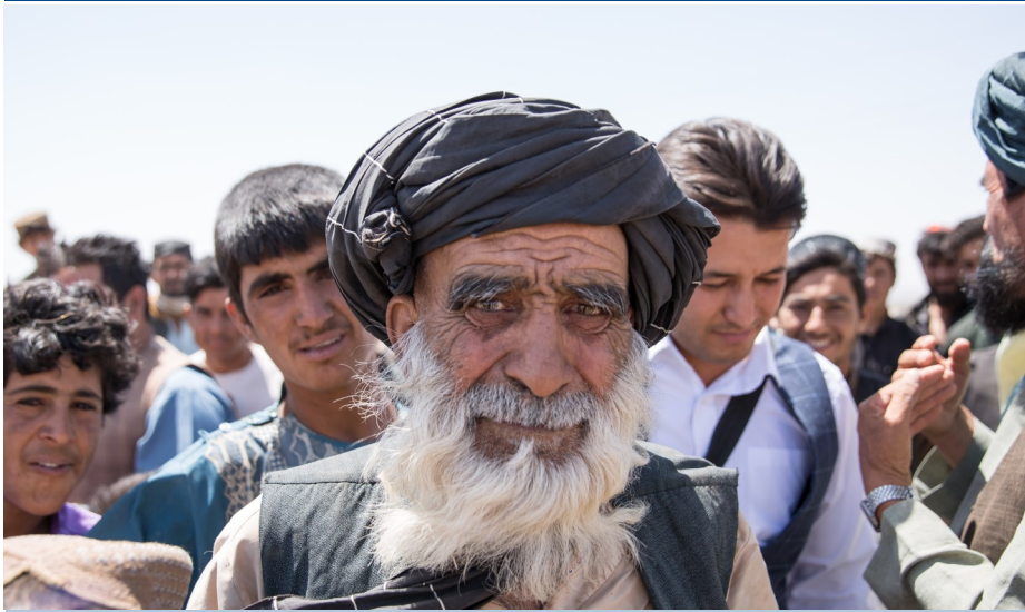
An Afghan man displaced by drought in a camp in Herat City