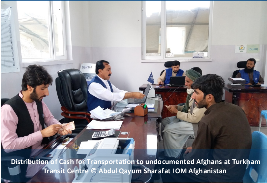
Distribution of Cash for Transportation to undocumented Afghans at Turkham Transit Centre